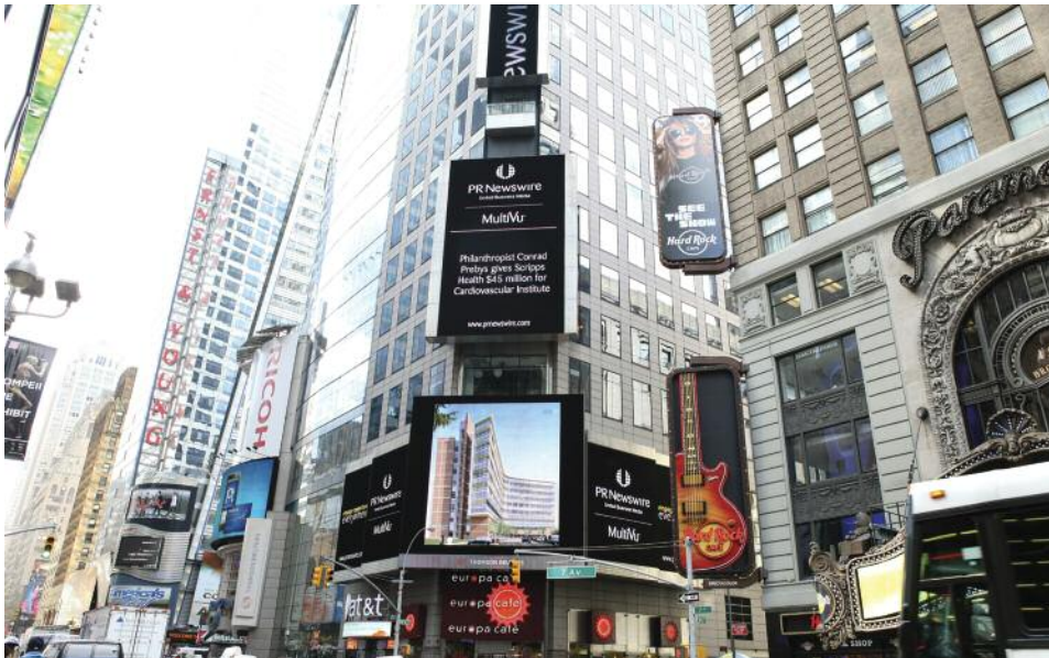
When Scripps unveiled the Conrad Prebys Cardiovascular Institute on July 27 the news reached as far as New York City. The announcement graced the streets of Times Square on a digital billboard in the heart of the city, reaching more than 1.5 million people.